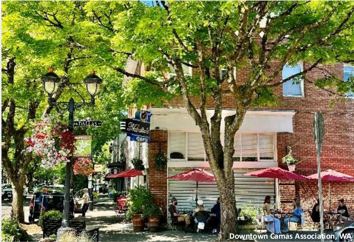
Downtown Camas Association, WA

Since 1980, over 2,000 programs have used the Main Street Approach™, resulting in: