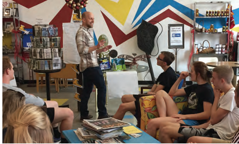
Woodbine incorporates the community’s student population in its placemaking initiatives to help seed the next generation of leaders.